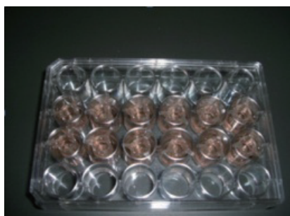
activated BBB Kit™

1. Remove all 12 inserts from BBB Kit™ into wells of the Wash Plate containing assay buffer with clean tweezer.